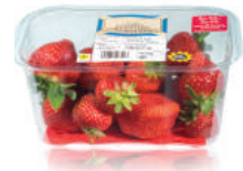
PRODUCE | A-PET

for more information UK +44 (0) 1625 856 600 America +1 804 447 9038 Australia +61 (0) 3 9397 0955