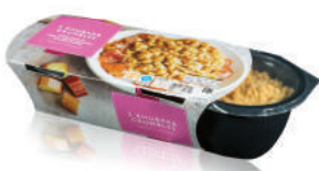
PUDDINGS | C-PET