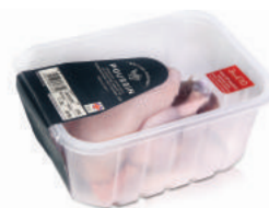
POULTRY | POLYPROP