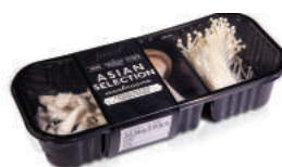
PRODUCE | C-PET