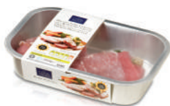
PORK | SMOOTH WALL FOIL