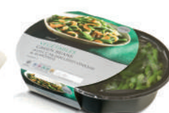
PRODUCE | C-PET