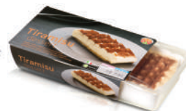
PUDDINGS | A-PET