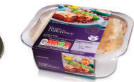
READY MEALS | SMOOTH WALL FOIL

for more information UK +44 (0) 1625 856 600 America +1 804 447 9038 Australia +61 (0) 3 9397 0955