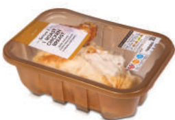
POULTRY | POLYPROP