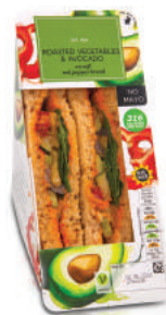
SANDWICHES | BOARD

Bespoke Air supply as-per customer specification