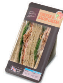
SANDWICHES | BOARD